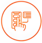
Intelligent Control Panel

Whether you're looking to create a serene retreat, a stylish home office, or a unique Airbnb experience, our capsule lodges provide the ideal solution.