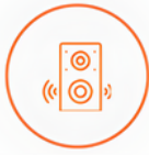
Integrated Sound System