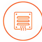
Fresh Air System