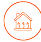
Electric Floor Heating