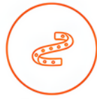
Intelligent Strip Lighting