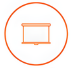
Automatic Projector Screen